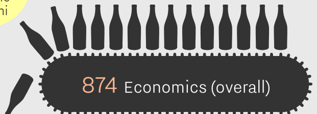
Yquem Quality score vs average market price

Yquem has the best Brand score of any wine on Wine Lister.